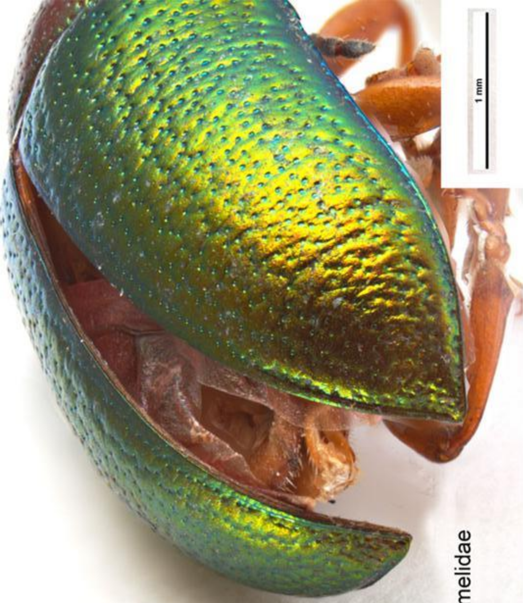
Chrysomelidae Sp. 14