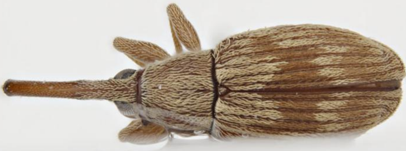
Apionidae sp 6