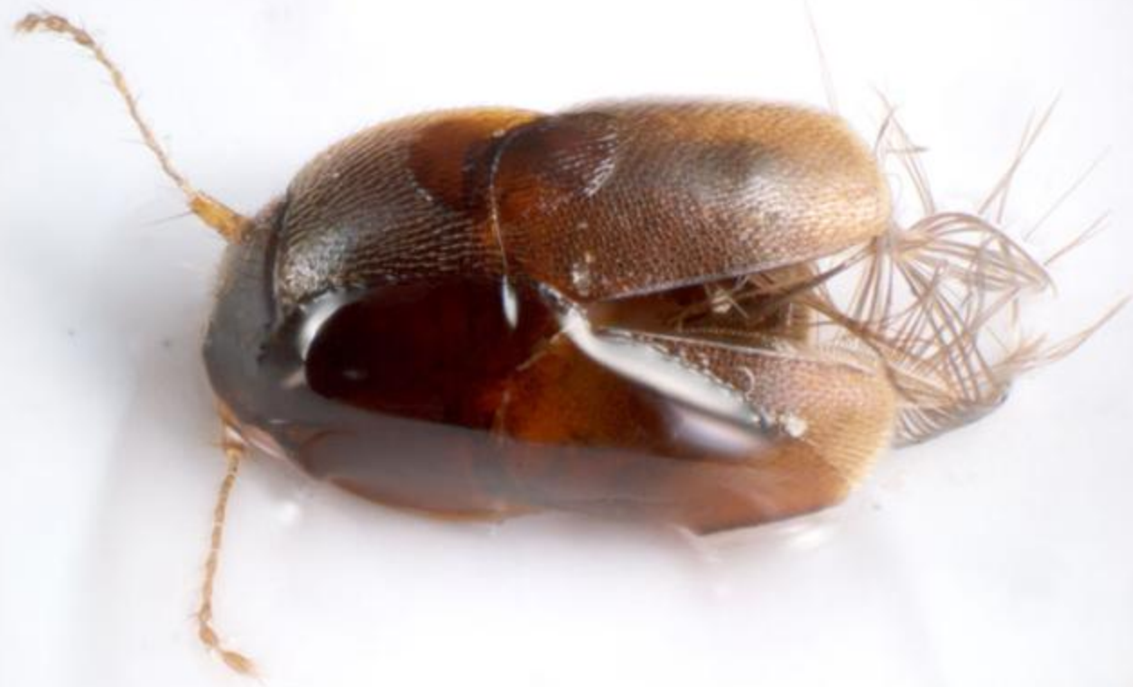
Ptiliidae sp 2