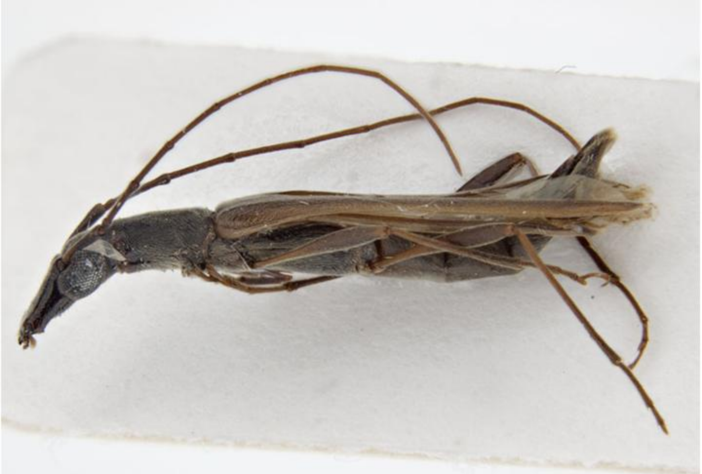
Cerambycidae sp 5