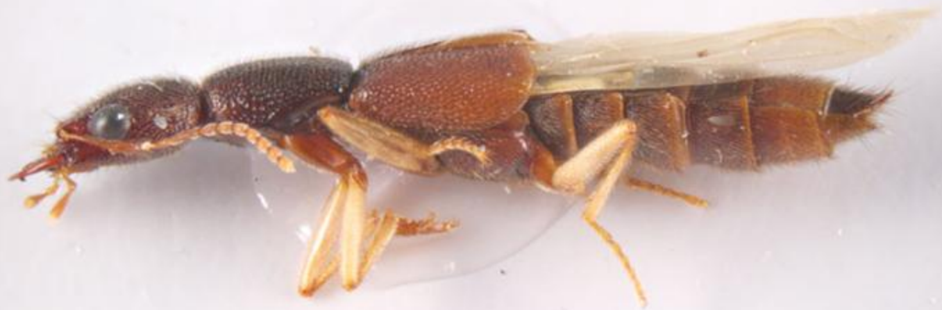
Staphylinidae sp 14