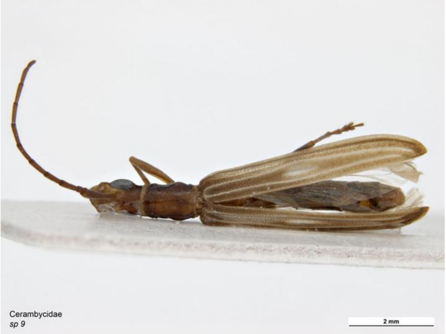
Cerambycidae sp 9