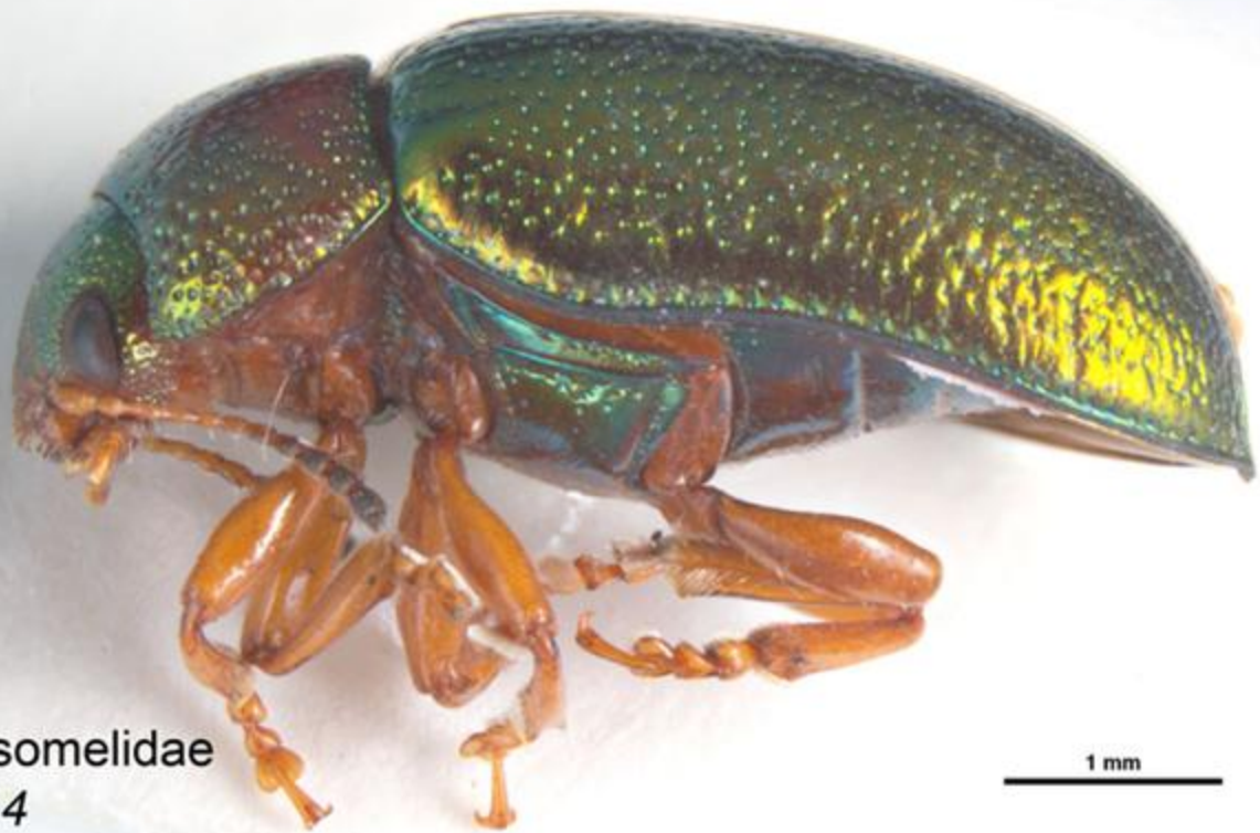
Chrysomelidae Sp. 14