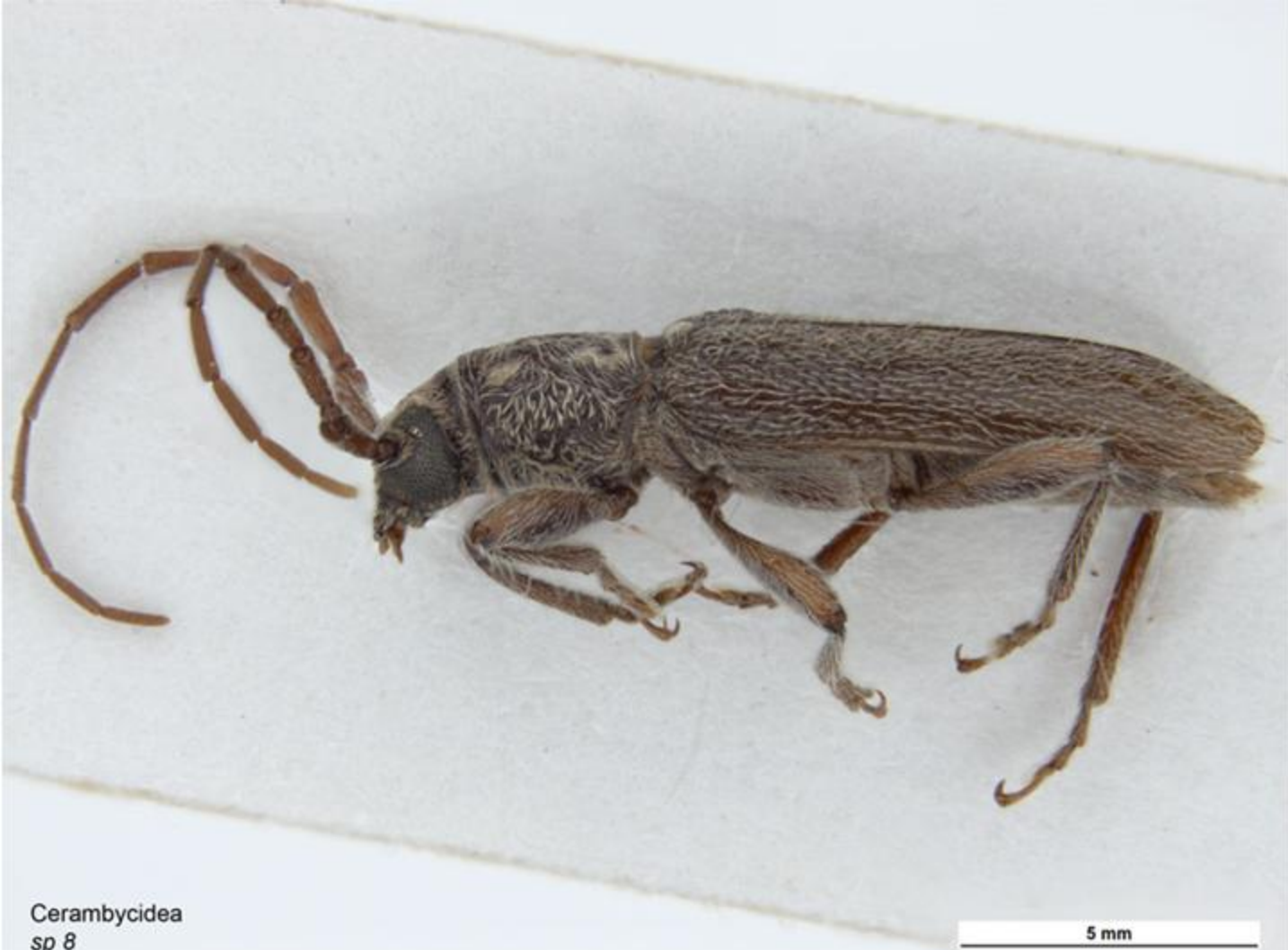
Cerambycidae sp 8