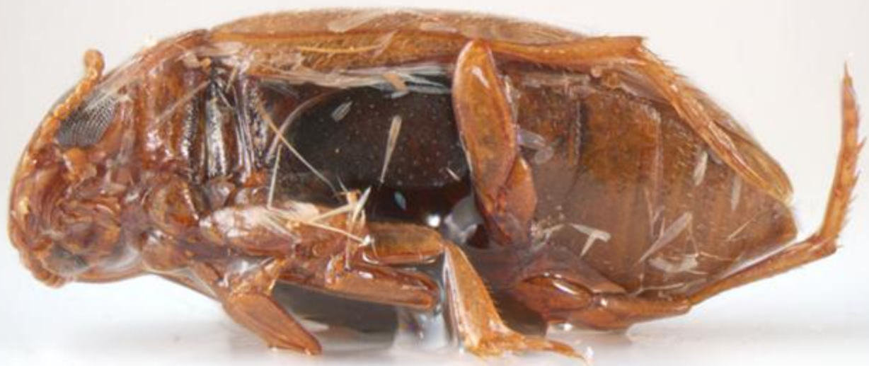
Dytiscidae Allodessus (?) sp 1