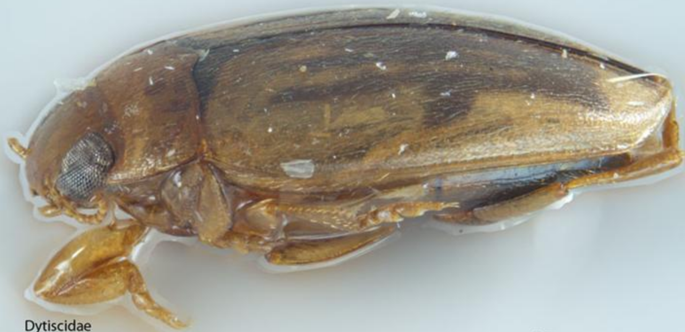
Dytiscidae Limbodessus (?) sp 1