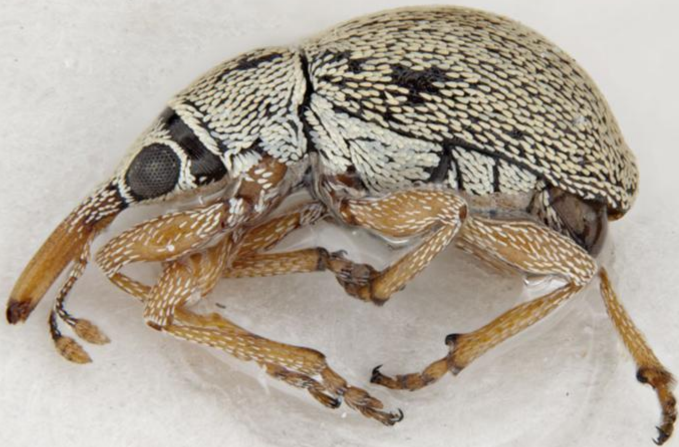
Apionidae sp 3