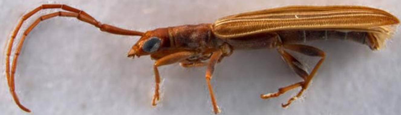
Cerambycidae Sp. 3