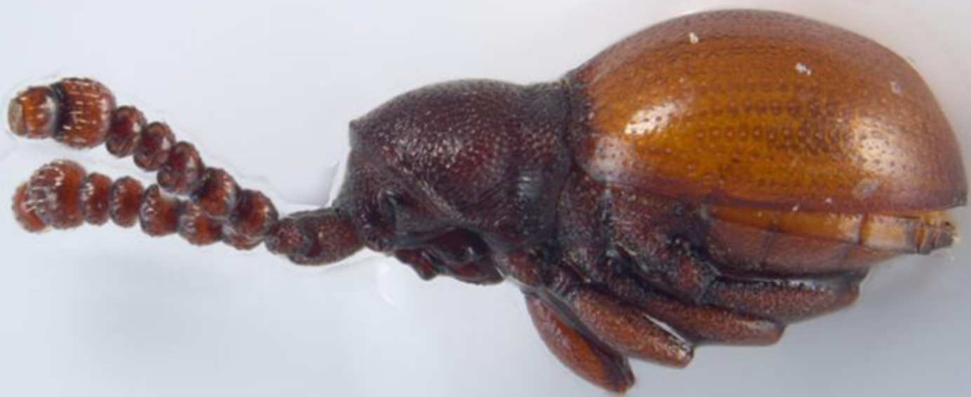
Ptinidae Polyplocotes sp 2