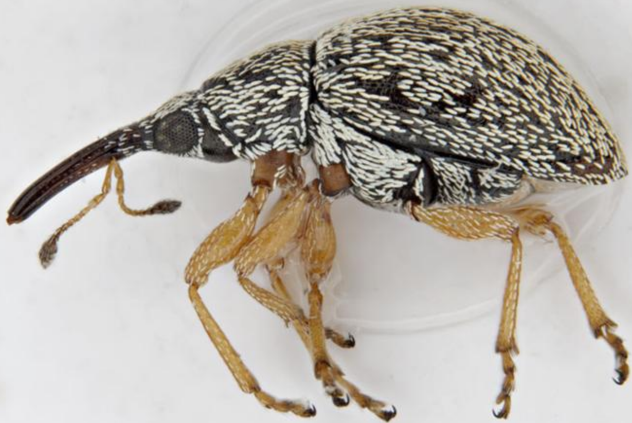
Apionidae sp 4