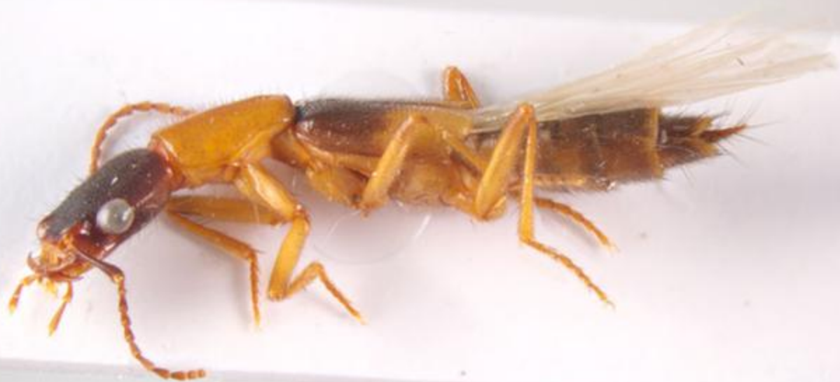
Staphylinidae sp 9