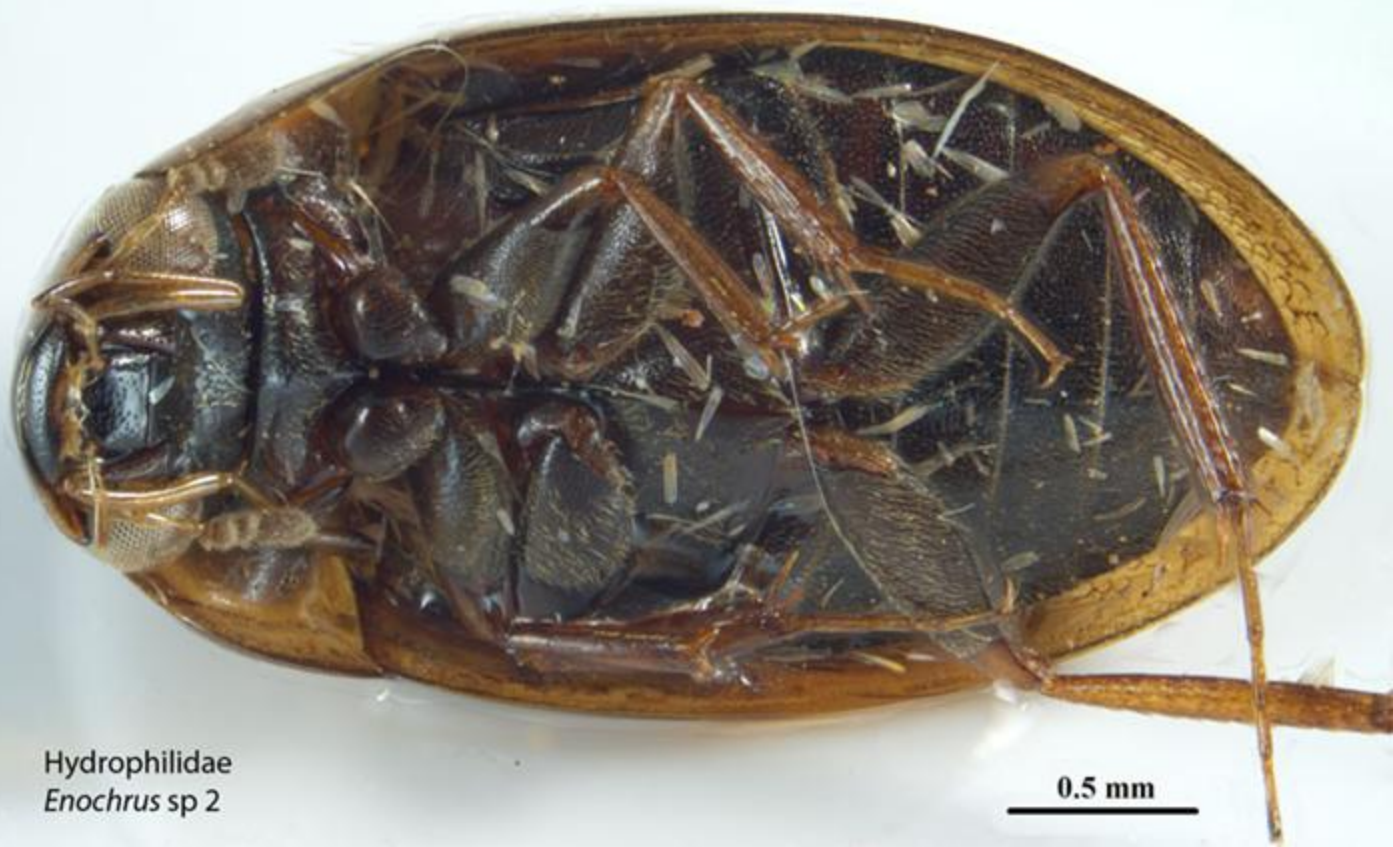
Hydrophilidae Enochrus sp 2