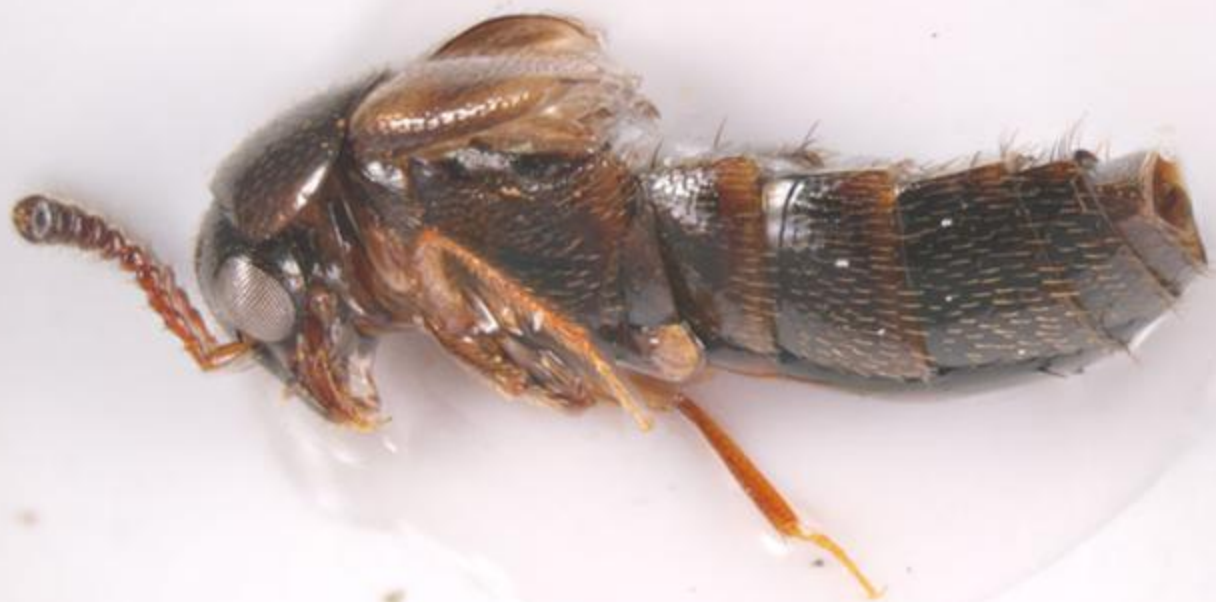
Staphylinidae sp 15