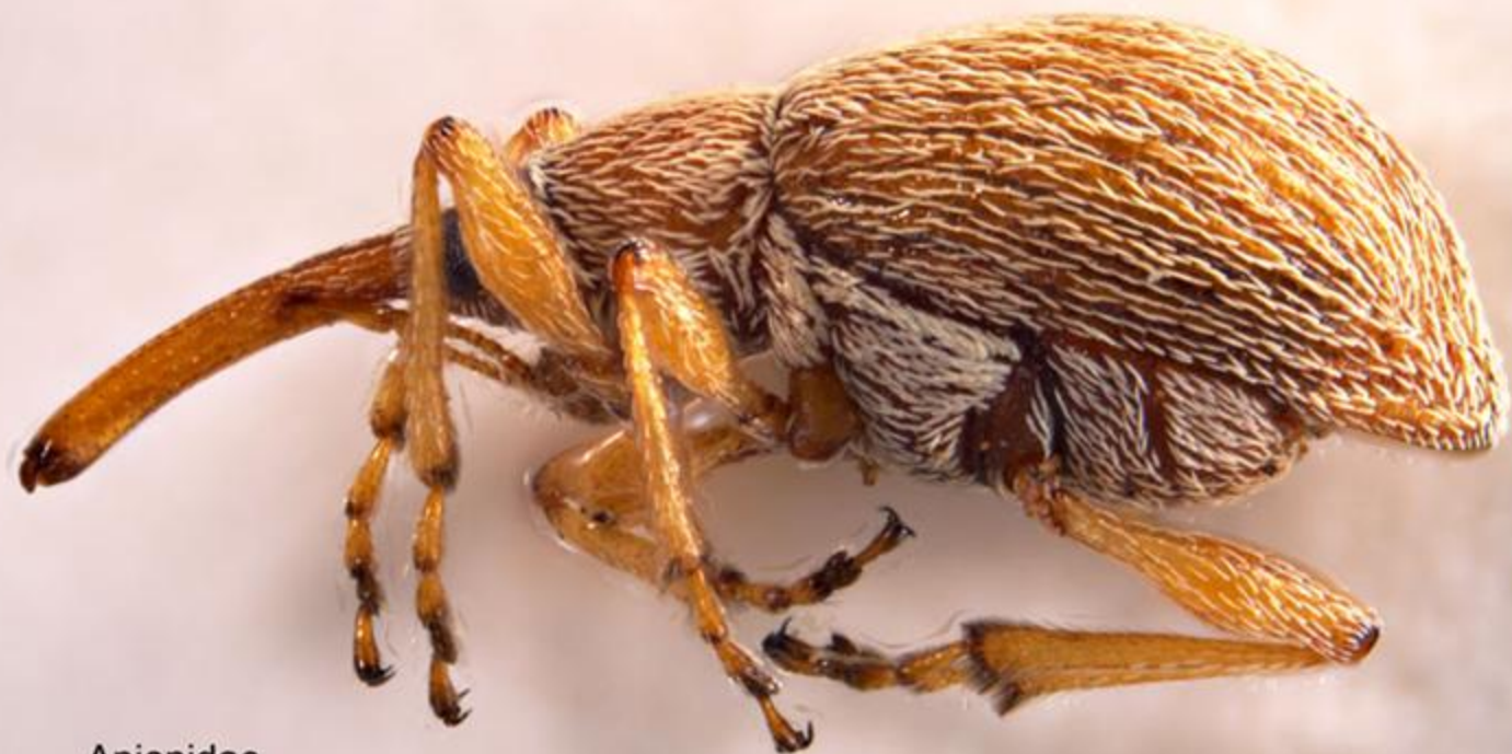
Apionidae Sp. 1