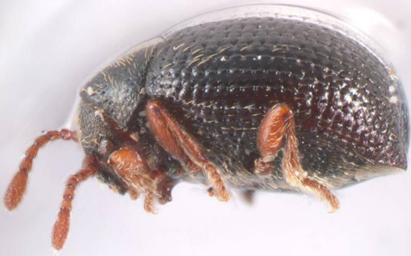
Ptinidae sp 2