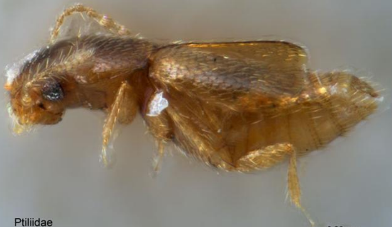
Ptiliidae Sp. 1