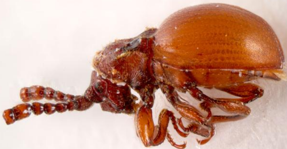
Ptinidae Diplocotes sp 1