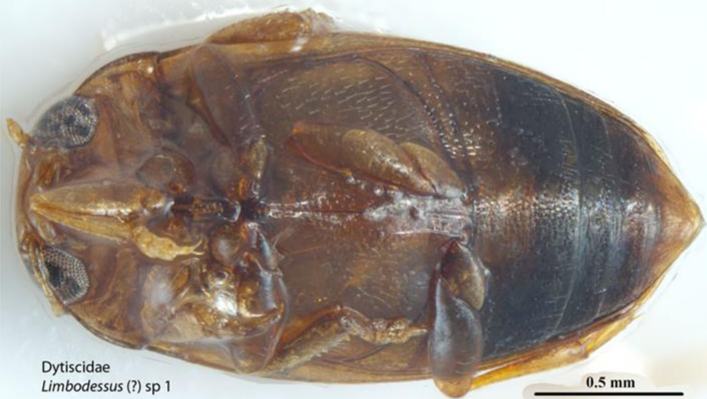
Dytiscidae Limbodessus (?) sp 1