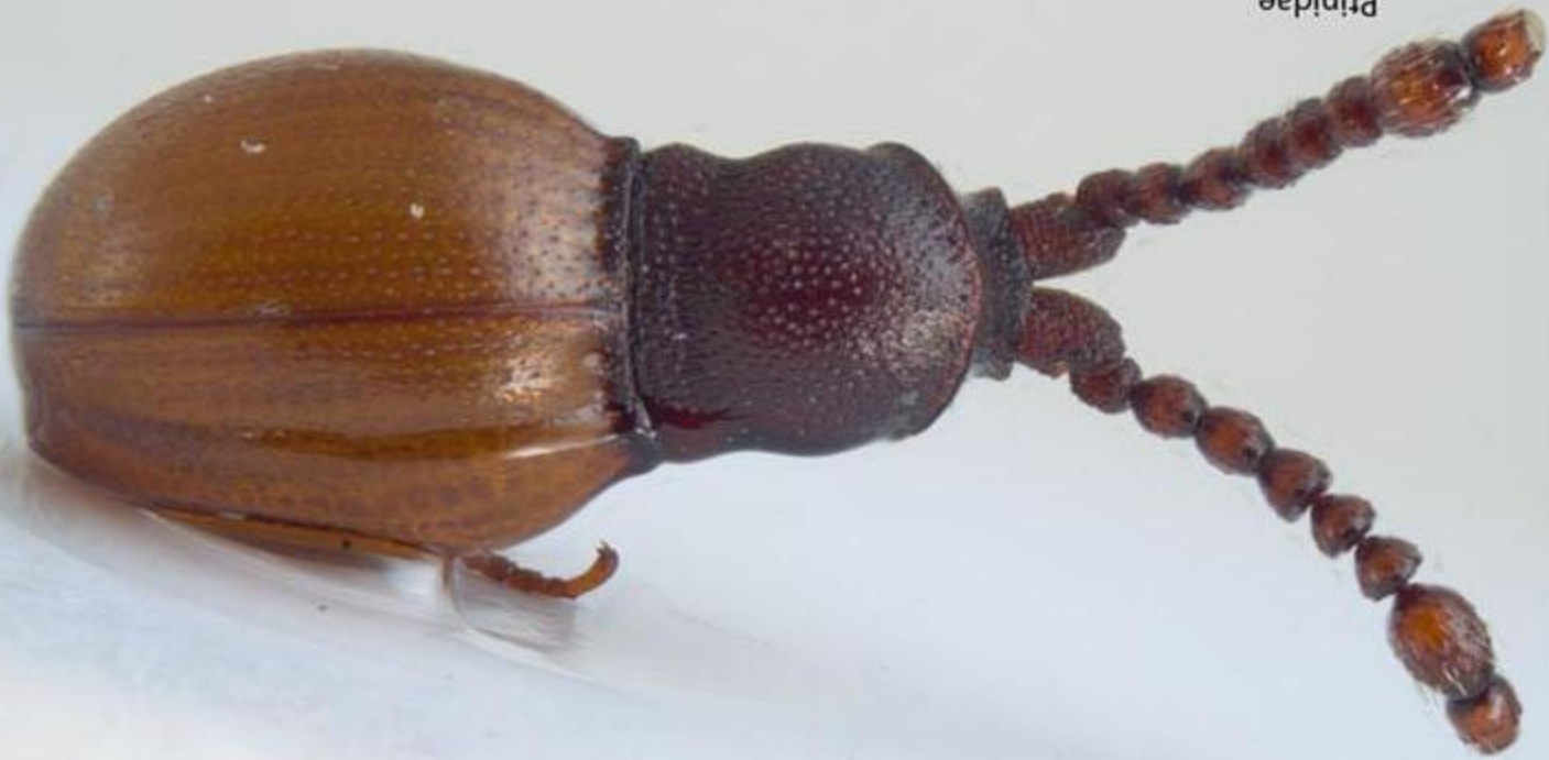
Ptinidae Polyplocotes sp. 2