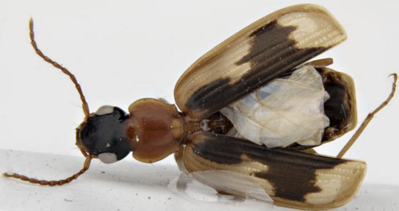
Carabidae sp 12