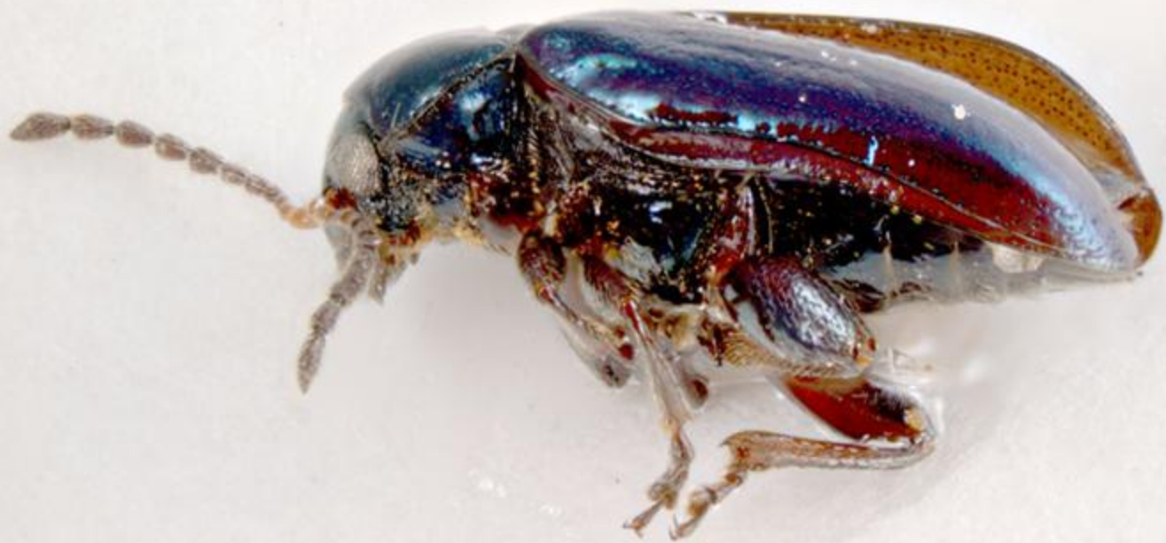
Chrysomelidae sp 18