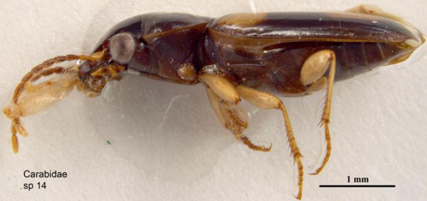
Carabidae sp 14