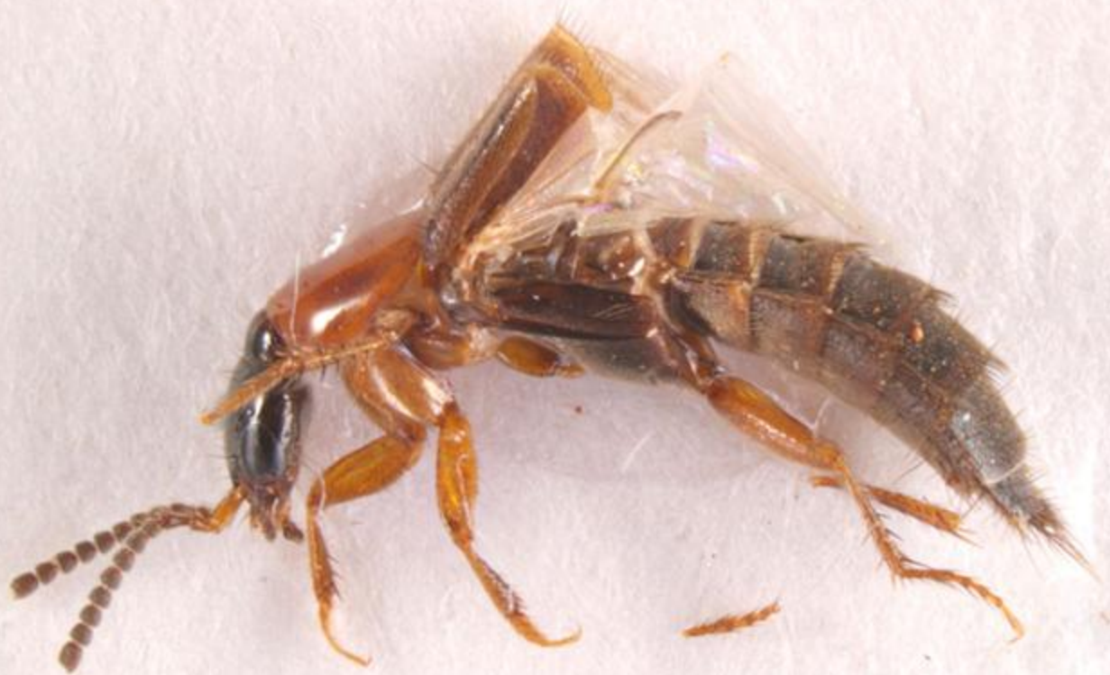
Staphylinidae sp 10