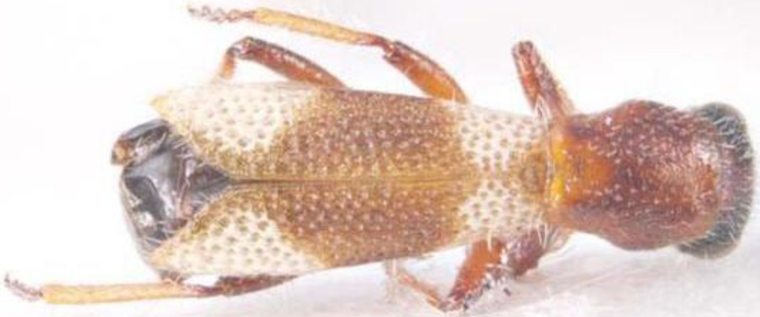
Cleridae Alleidea sp. 1