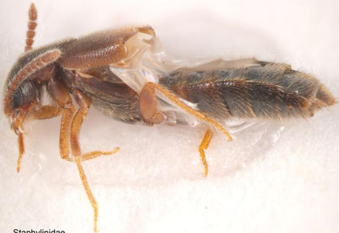
Staphylinidae sp 2