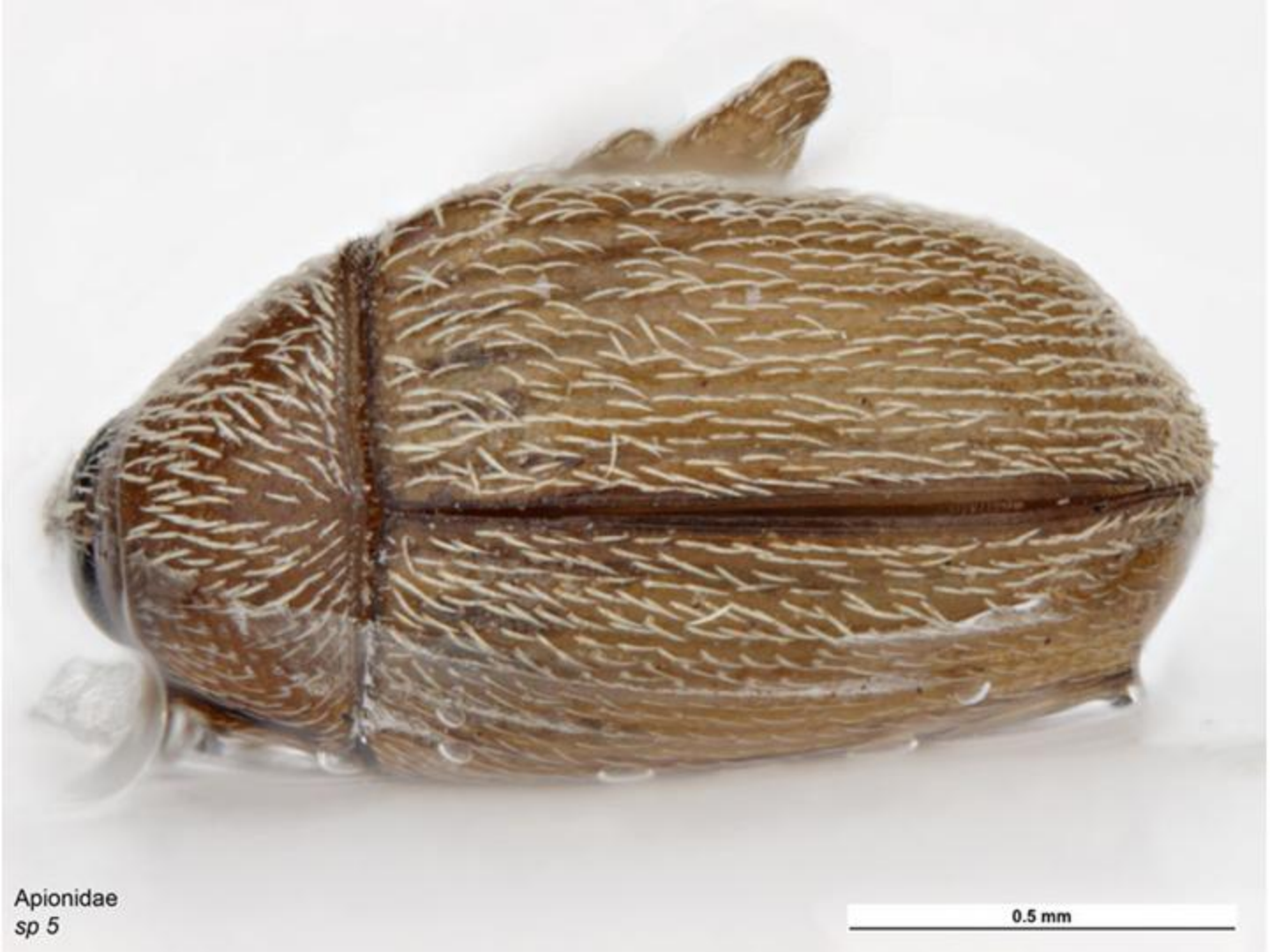
Apionidae sp 5