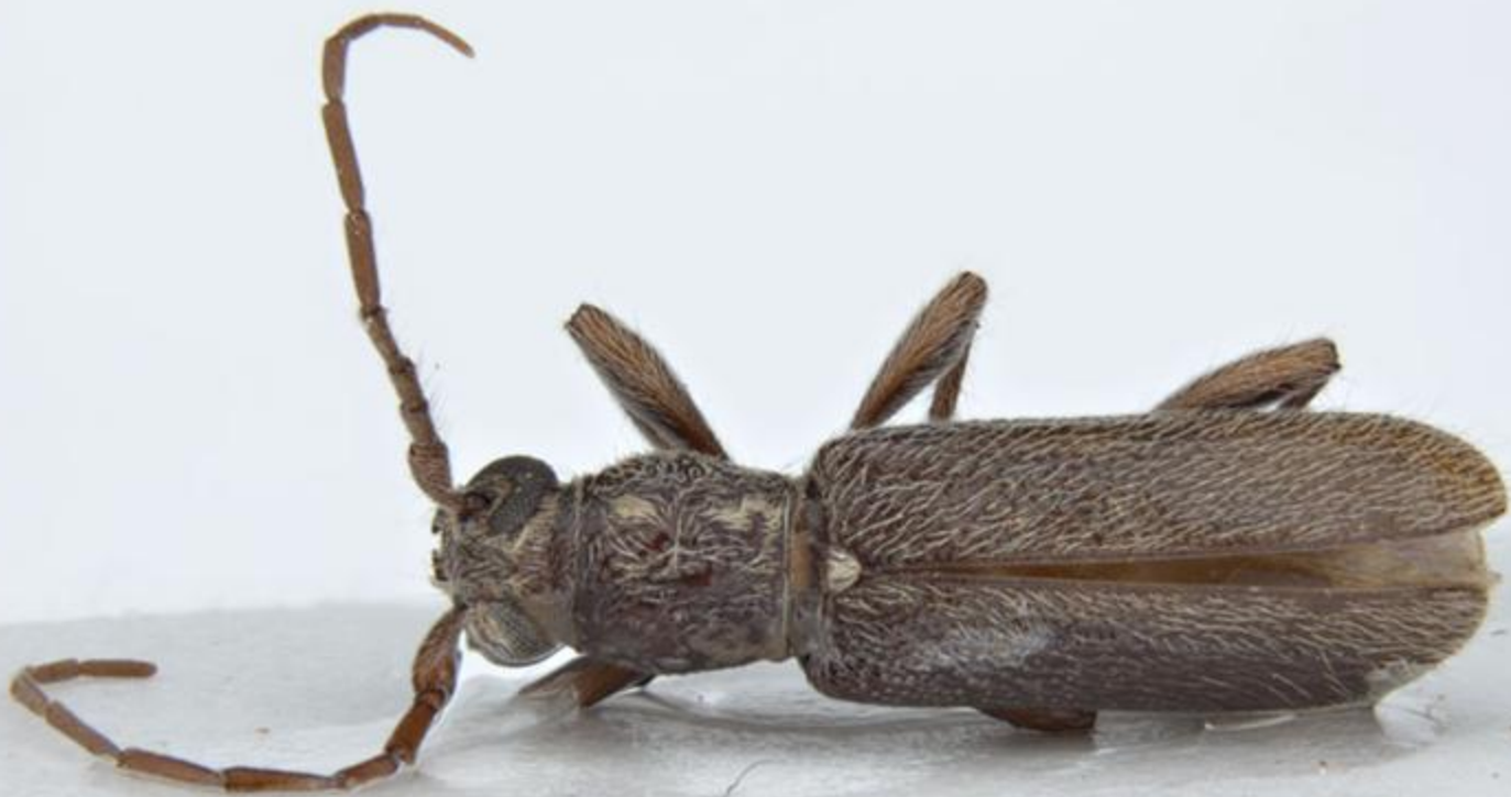
Cerambycidae sp 8