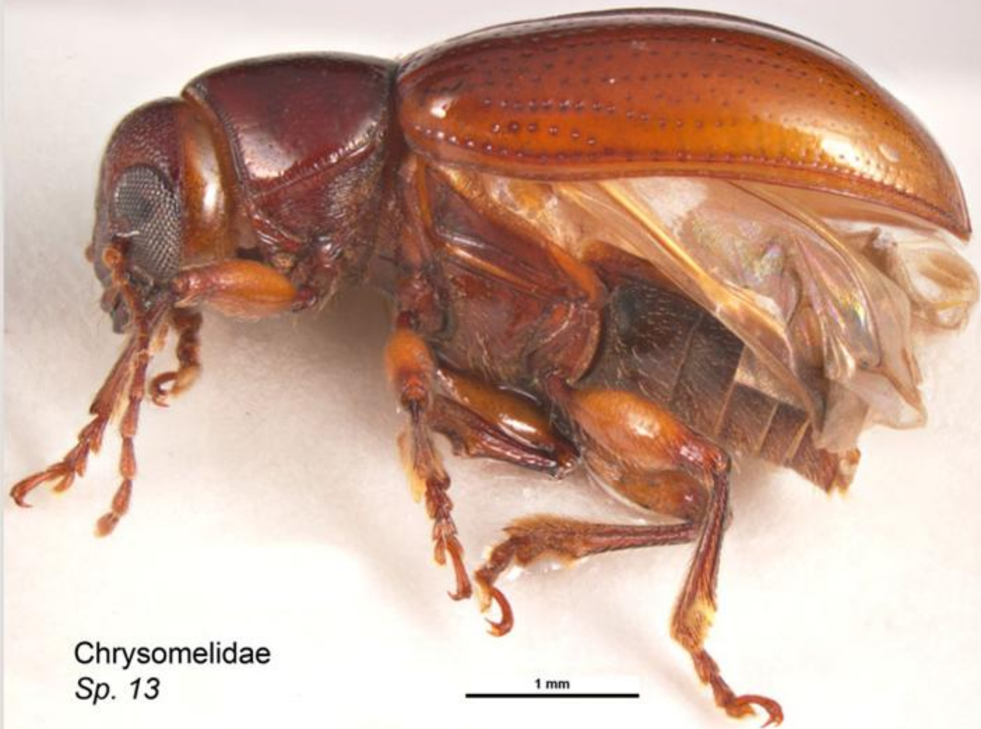
Chrysomelidae Sp. 13