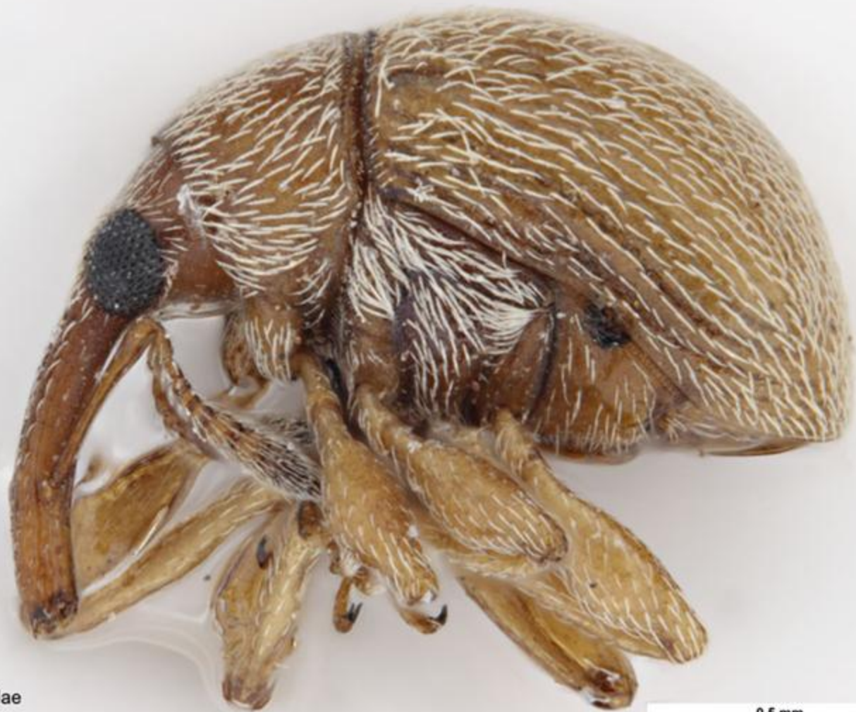
Apionidae sp 5