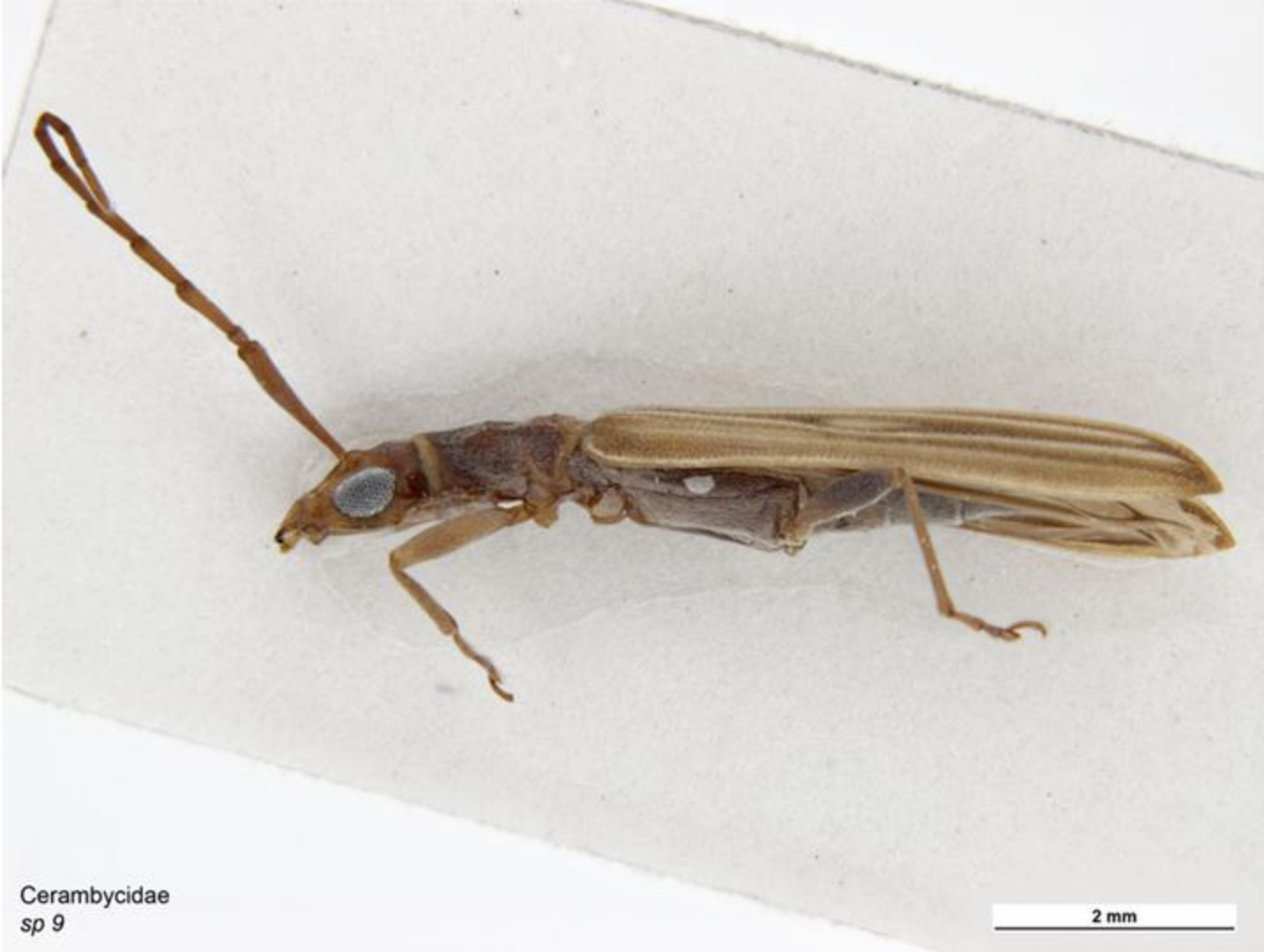
Cerambycidae sp 9