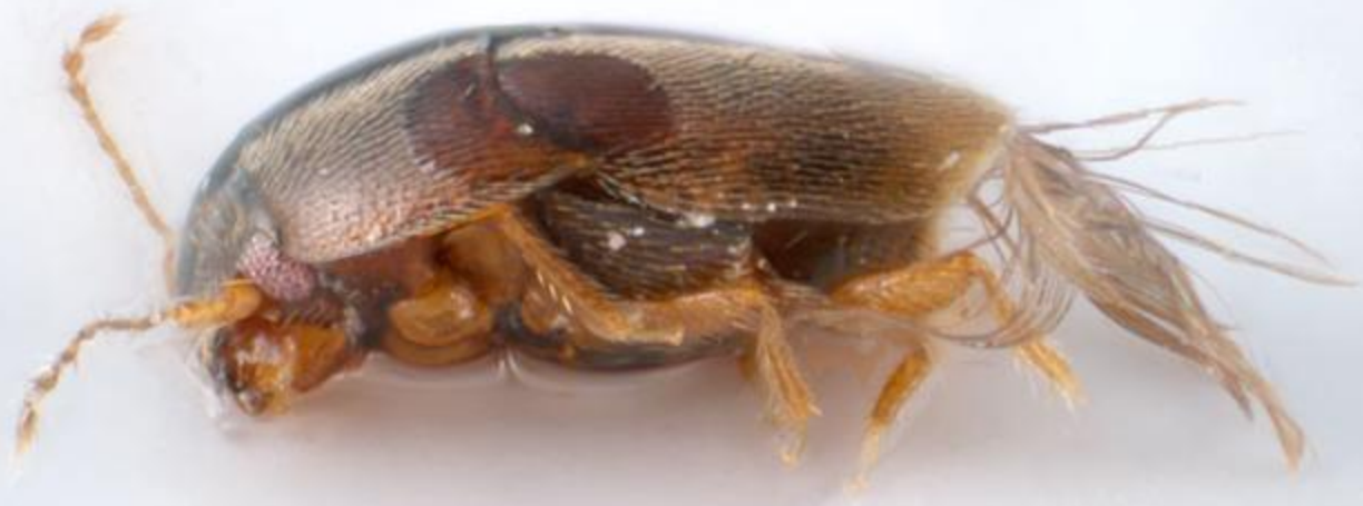
Ptiliidae sp 2