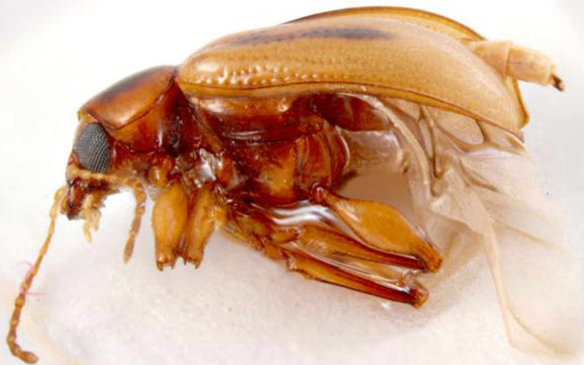
Chrysomelidae sp 19