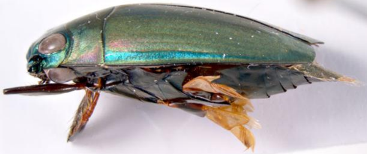
Gyrinidae sp 1