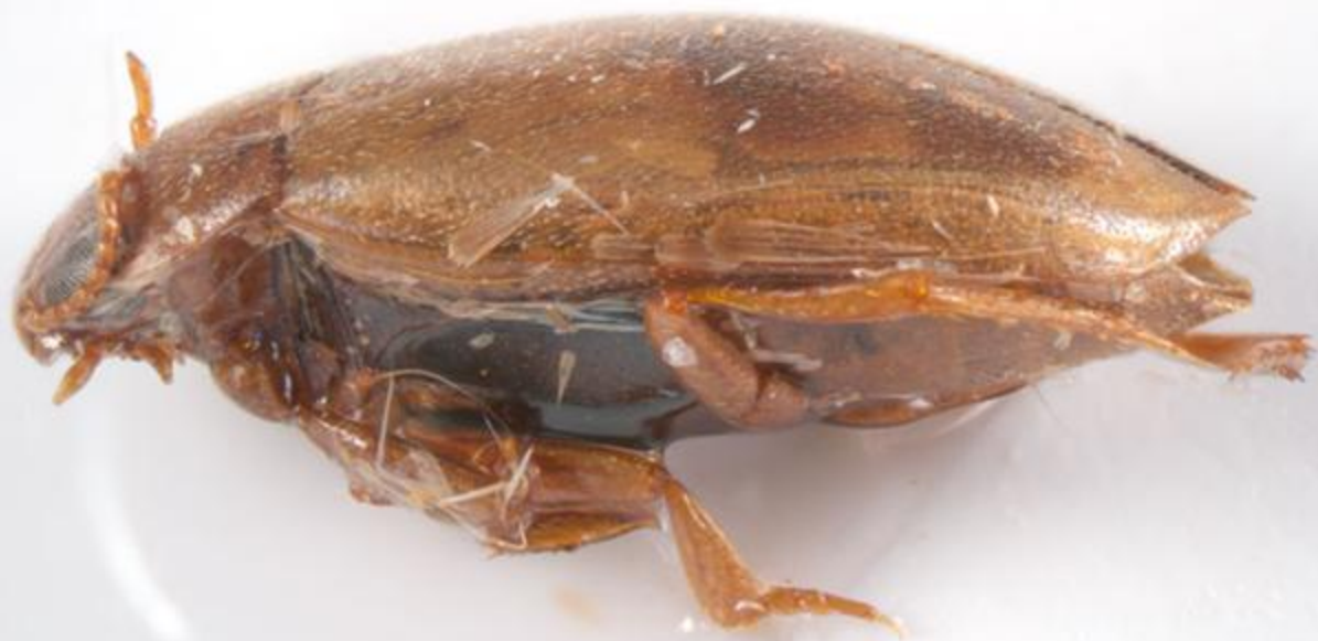
Dytiscidae Allodessus (?) sp 1