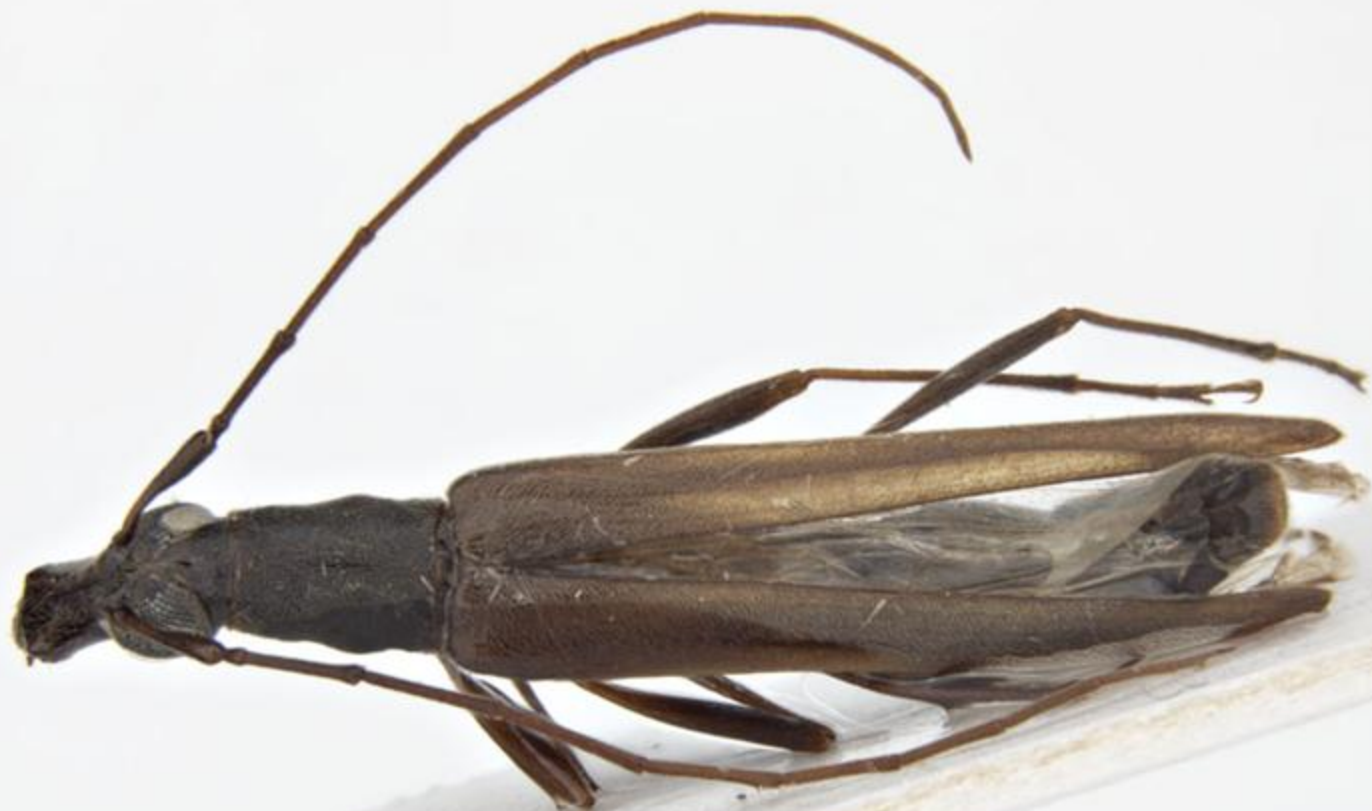
Cerambycidae sp 5