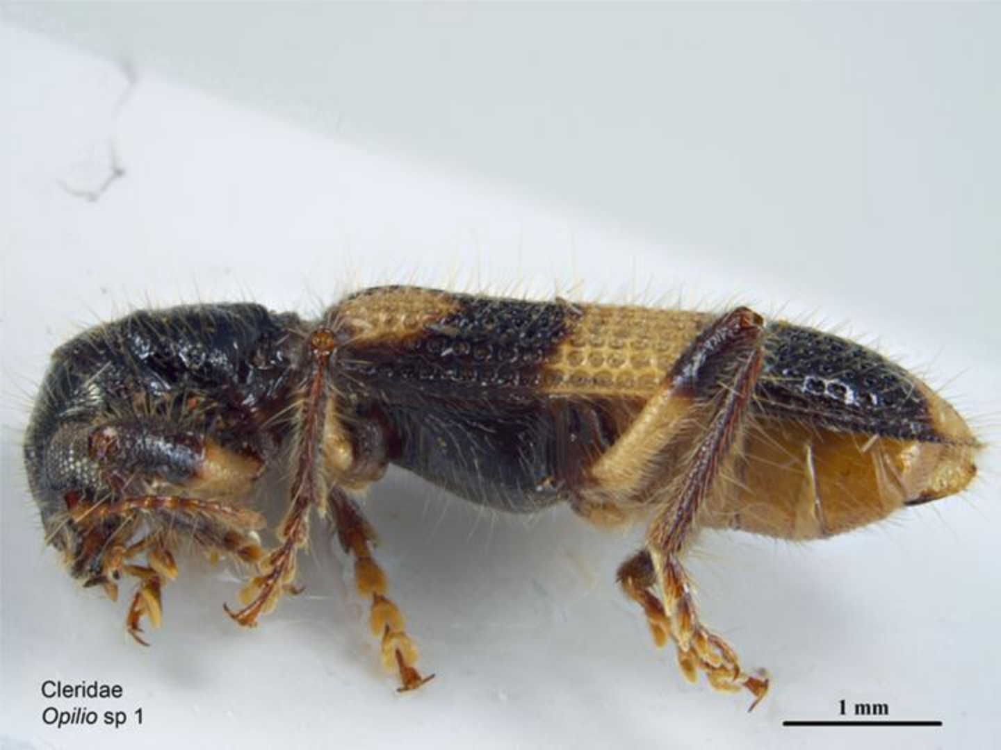
Cleridae Opilio sp. 1