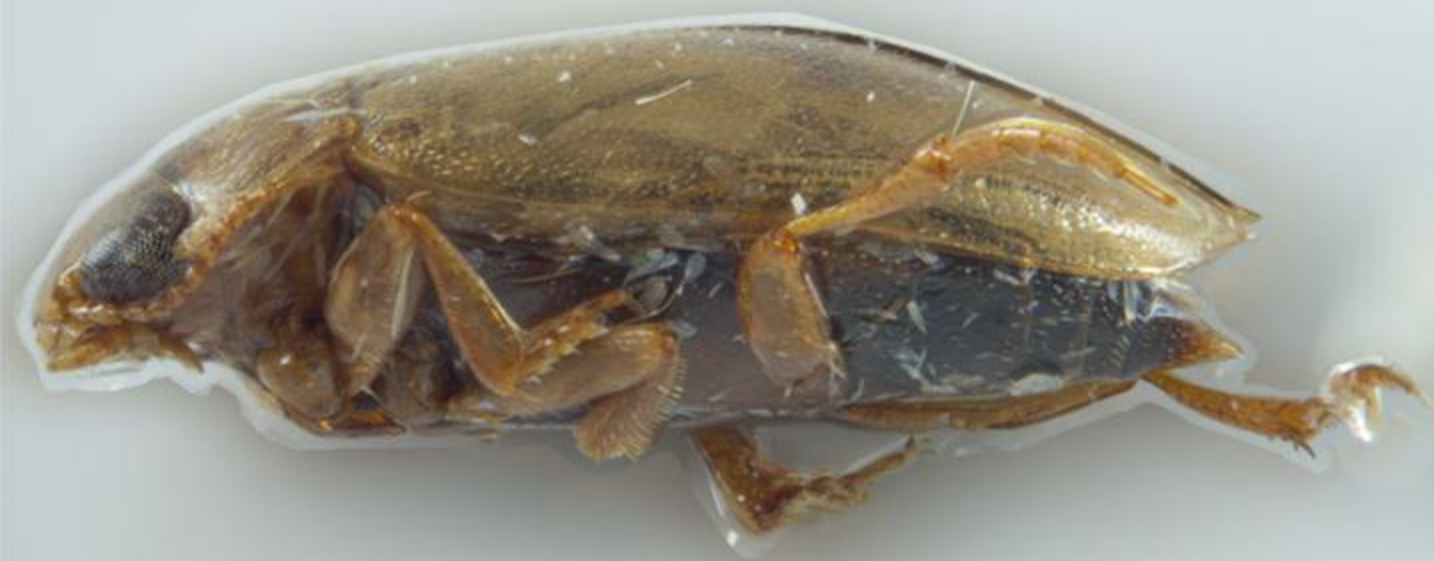
Dytiscidae Limbodessus (?) sp 2