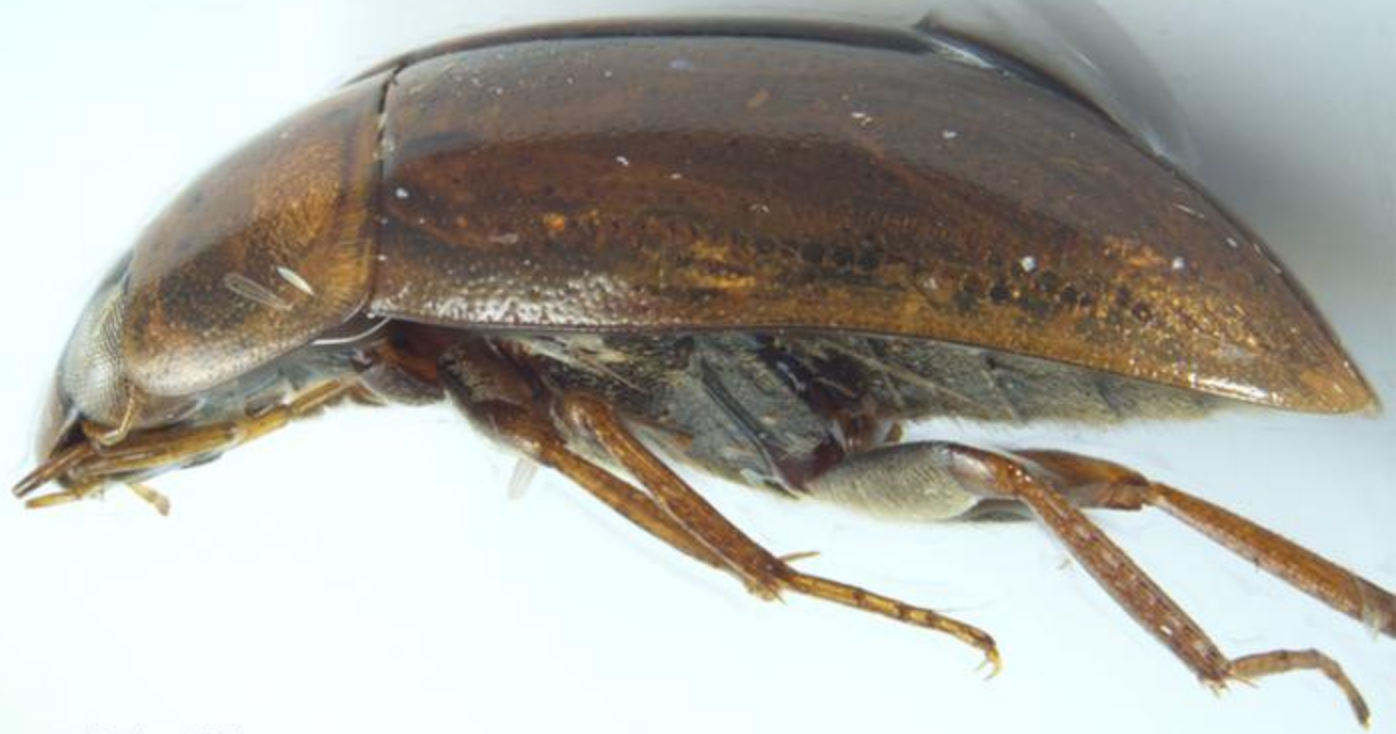
Hydrophilidae Enochrus sp 2