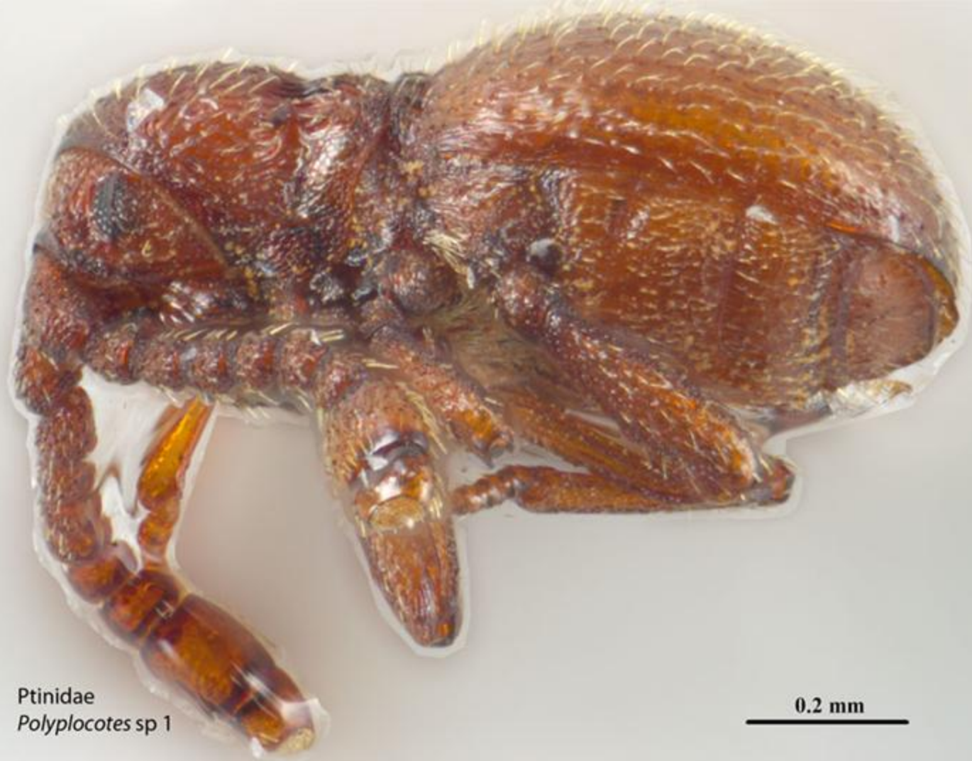
Ptinidae Polyplacotus sp 1