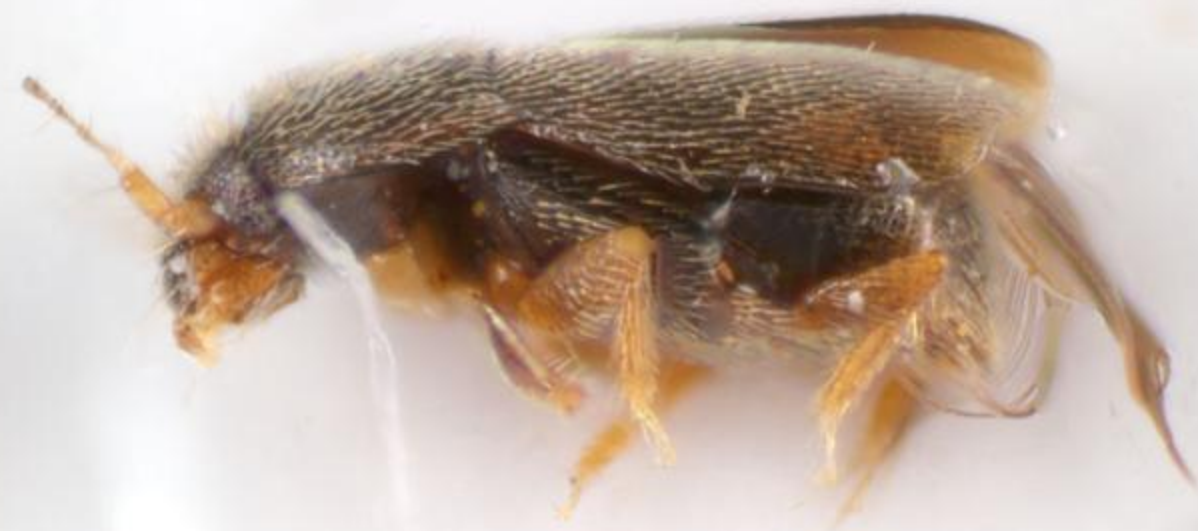
Ptiliidae sp 4