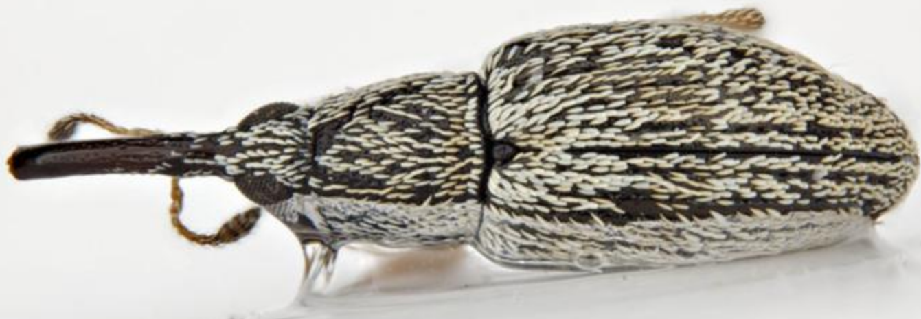
Apionidae sp 4