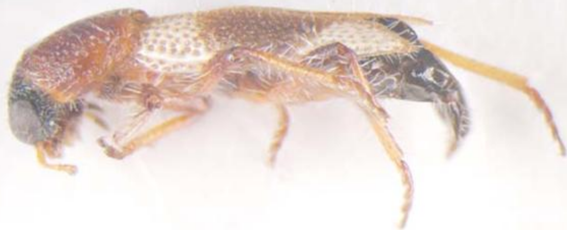
Cleridae Allelidea sp.1