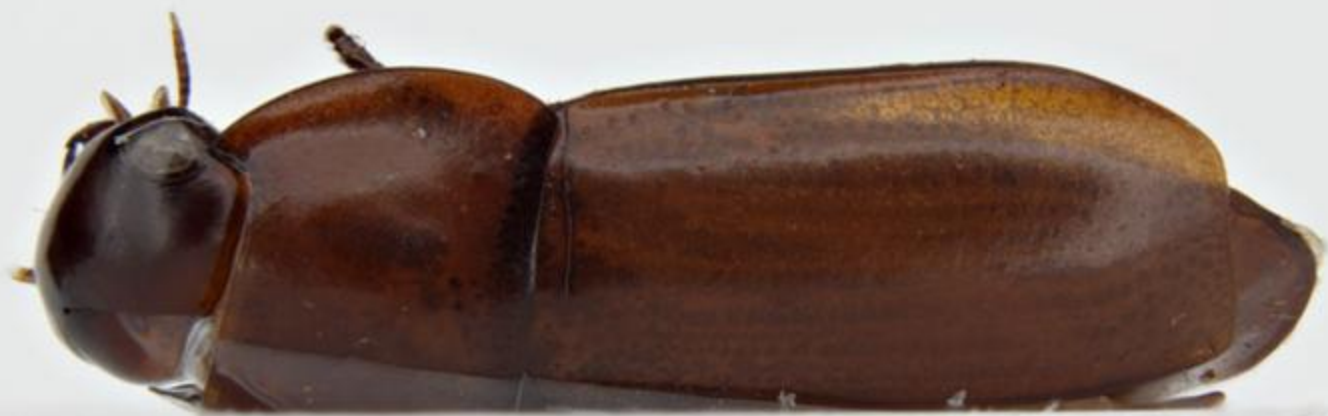
Carabidae Adelotopus sp 1