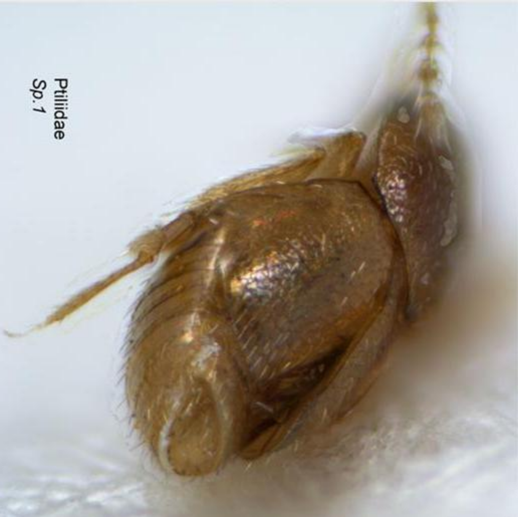
Ptiliidae Sp. 1